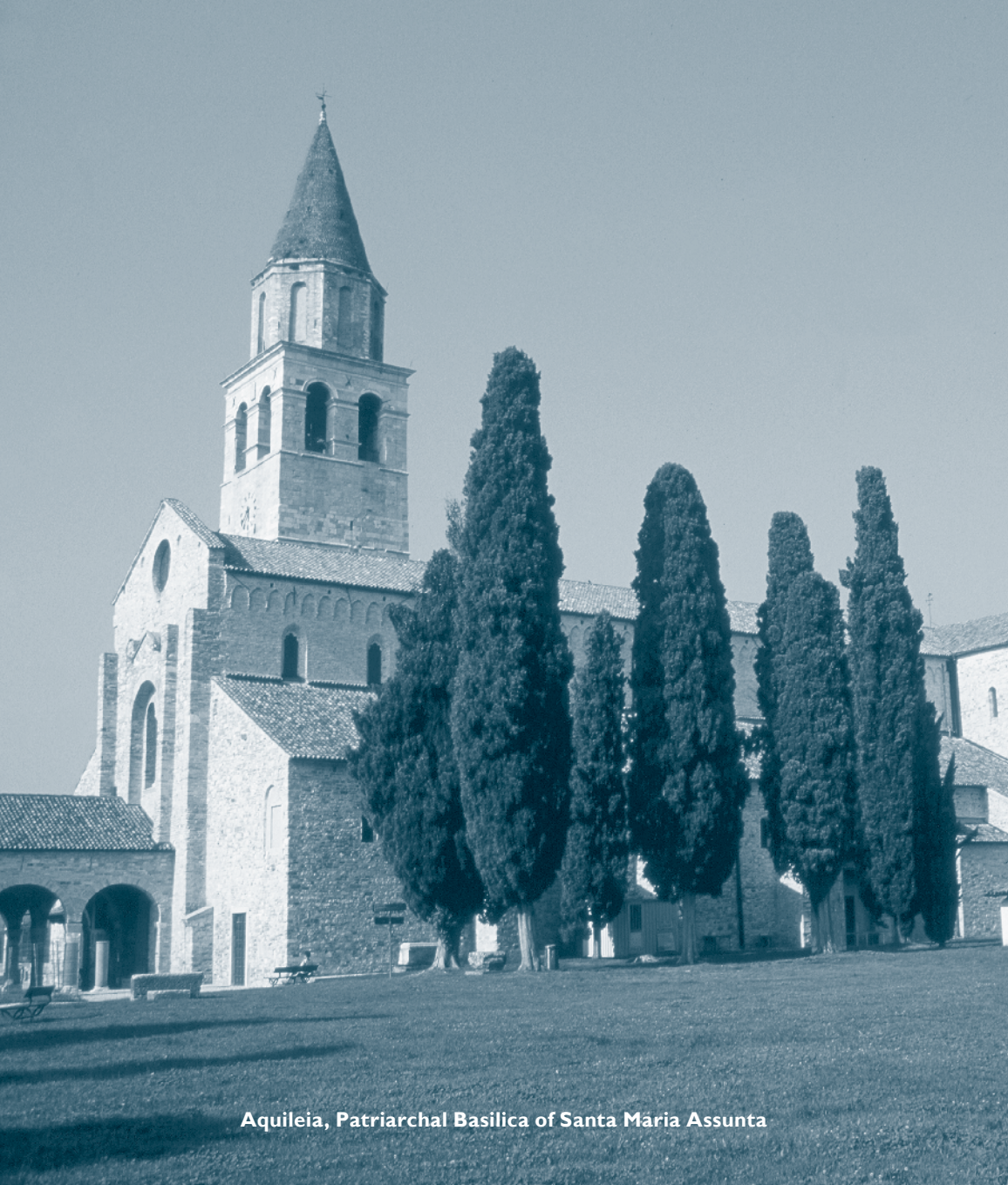
Aquileia, Patriarchal Basilica of Santa Maria Assunta