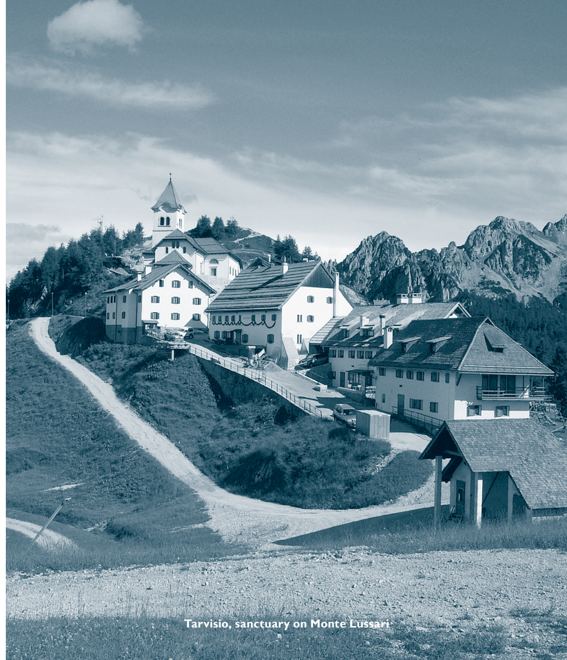
Tarvisio, sanctuary on Monte Lussari

The Slovenian and Austrian branches of the Heavenly Way are not yet equipped to be taken in an organized way. All updates on the evolution of their state are available, however, on the site of the Heavenly Way: www.camminocelleste.eu .